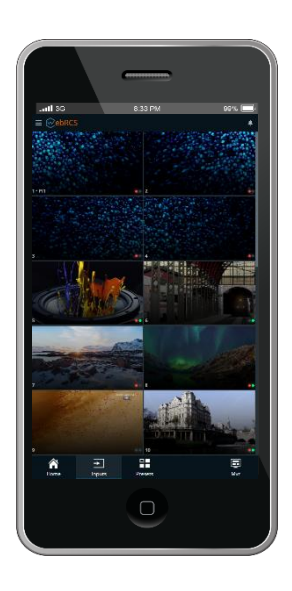
The Web RCS is compatible with any device or platform, including iOS and Android devices